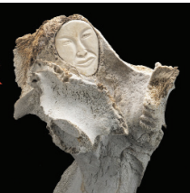
Manasie Akpaliapik. Inuit Universe The Raymond Brousseau collection