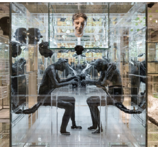
The Flux and the Puddle David Altmejd