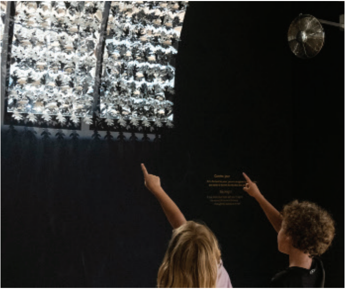
Peninsulas - Family Gallery