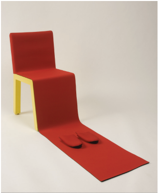
Decorative Arts and Design