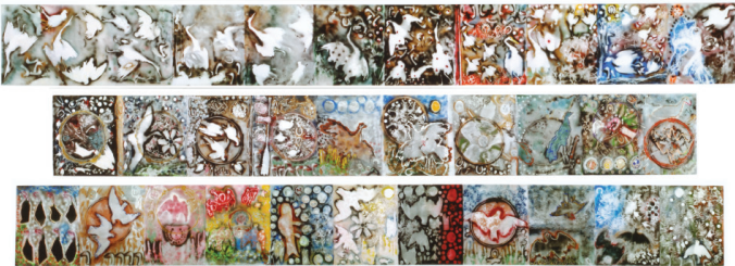
Jean-Paul Riopelle Tribute to Rosa Luxemburg