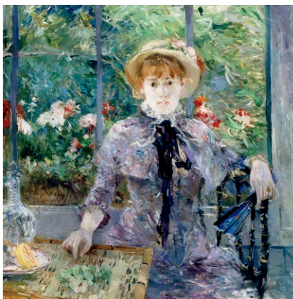
BERTHE MORISOT, IN THE COUNTRY (AFTER LUNCH) (DETAIL) , 1881. OIL ON CANVAS, 81 X 100 CM. LAWRENCE ELISON COLLECTION