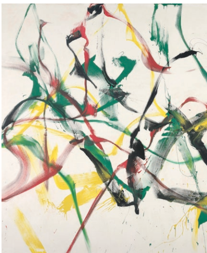
MARCEL BARBEAU, KITCHENWOMEN, NO. 4 (DETAIL) , 1972. ACRYLIC ON CANVAS, 260 X 390 CM. MUSÉE NATIONAL DES BEAUX-ARTS DU QUÉBEC, PURCHASE (1973.574). ESTATE OF MARCEL BARBEAU.

Also available as self-guided or bilingual media guide tours