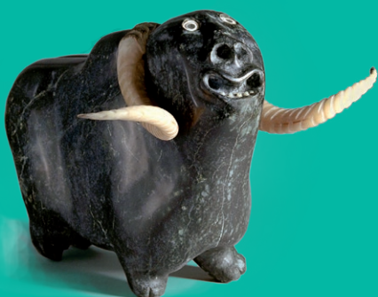
JUDAS ILLULUAQ, MUSK-OX WITH HUMAN FACE, 1984. PYROXENITE, OX HORN, CARIBOU ANTLER, ALABASTER, MINBAQ, BRUSSEAU INUIT ART COLLECTION. © ESTATE OF JUDAS ILLULUAQ.

Languages: English or French Length: 1½ hours