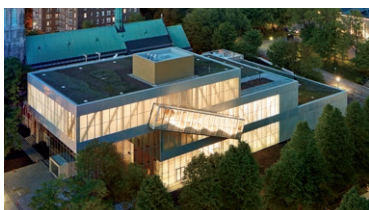
Pierre Lassonde pavilion Contemporary art

The MNBAQ is: 22 exhibit spaces, 400 years of Quebec's art history, more than 4,000 artists represented in the national collection. An architectural experience in 4 unique pavilions.