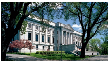
Gérard-Morisset pavilion Historical art