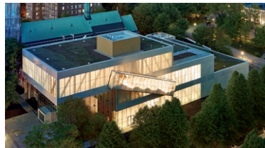
Pierre Lassonde pavilion Contemporary art

The MNBAQ is: 22 exhibit spaces, 400 years of Quebec's art history, more than 4,000 artists represented in the national collection. An architectural experience in 4 unique pavilions.