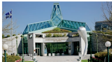
Central pavilion Family gallery