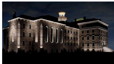
Charles-Baillairgé pavilion Modern art